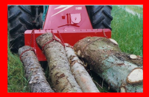
The dozerblade is designed with additional height and a wide log-towing bar to handle even the largest logs.