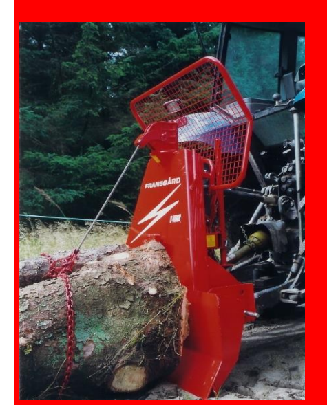
Protective screen guards the tractor in case a cable should break .

When pulling heavier logs the bottom pulley (optional V-3004 and V-3507) can easily be swung around the cable