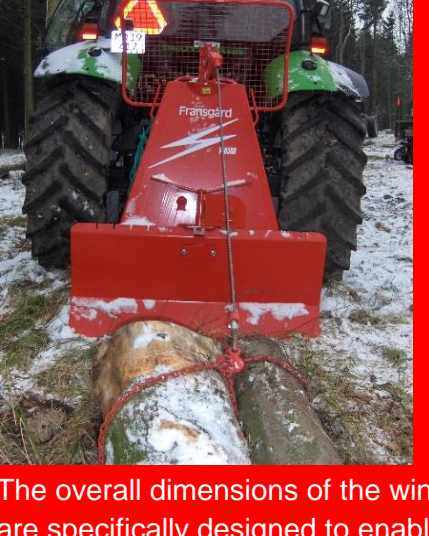
The overall dimensions of the winch are specifically designed to enable easier access in narrow paths.

This latch can be released when necessary, with the lever .